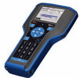
The protective rubber boot provides added protection in the field.

The 475 Field Communicator is designed, manufactured, and tested to very demanding specifications. It is ready to go wherever you need to go to get the job done.