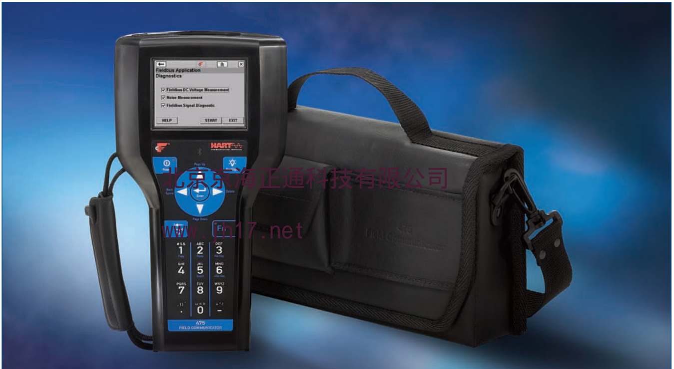
The 475 Field Communicator, with its handy carrying case, provides a single tool for configuring and diagnosing HART and FOUNDATION fieldbus devices.