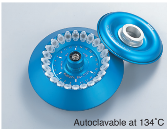
Autoclavable at 134°C

* Follow all instructions in the relevant Instruction & Service Manual when operating centrifuges.