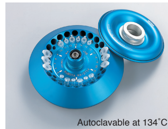
Autoclavable at 134°C