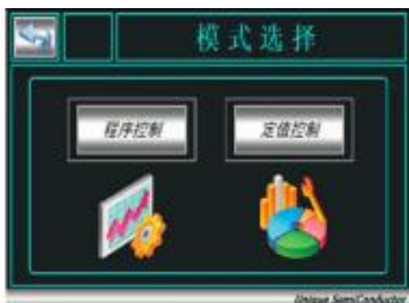
Display the interface