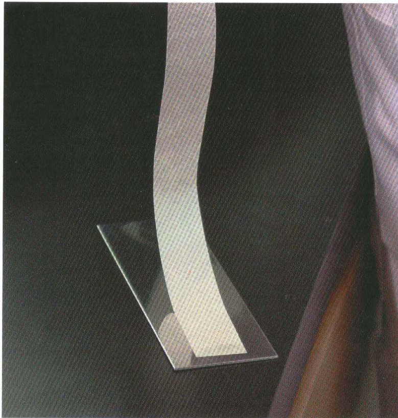
Figure 1. Quick stick specimen preparation.

6.1 Report the quick stick value(s) to the nearest 0.1 Newtons per centimeter (or to the nearest ounces per inch) of width.