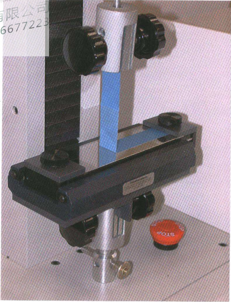
Figure 4. Test jig with bearings.