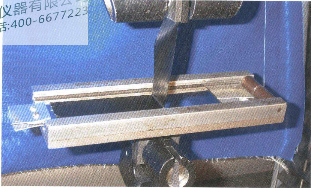
Figure 2. Inserting panel and hook attachment.