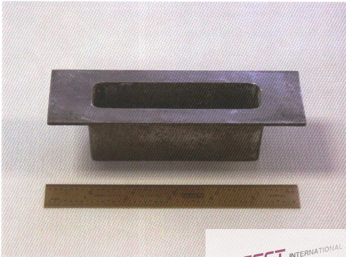
Figure 1. MTRV cup side view

Another method for determining water vapor penetration rate of pressure sensitive tape is ASTM D 3833.