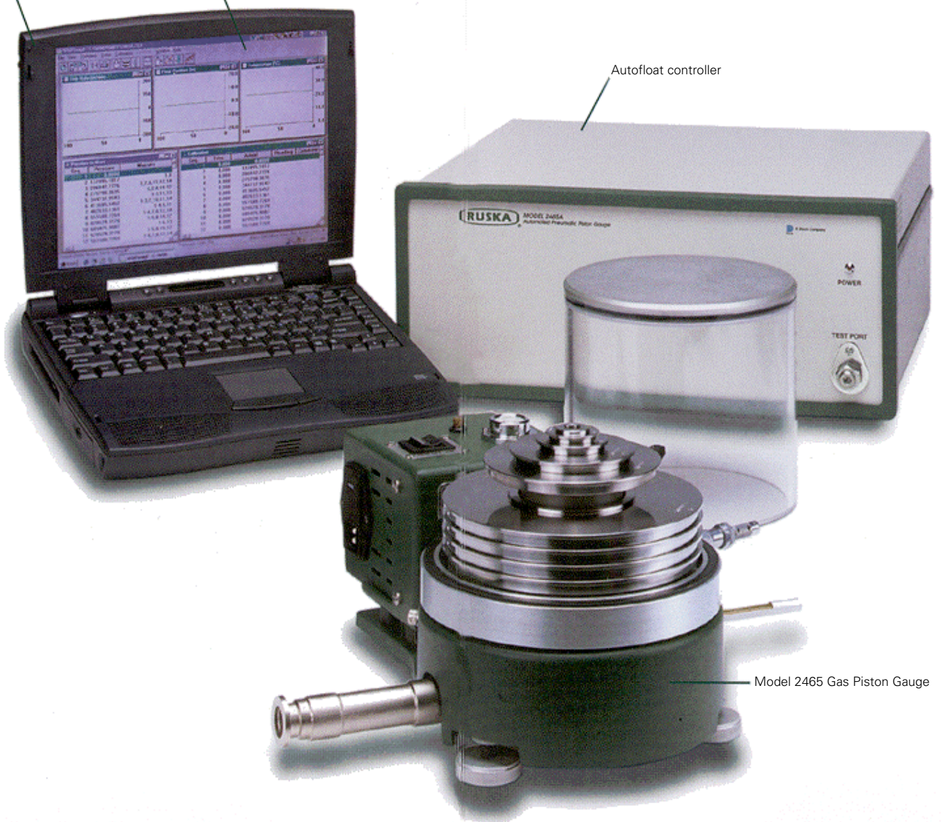
Model 2465 with autofloat controller and optional notebook PC shown.