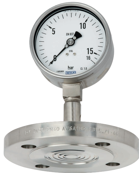
Diaphragm seal system, model DSS27M