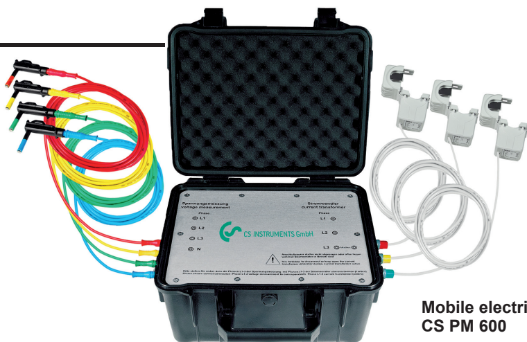
Mobile electricity/effective power meter CS PM 600