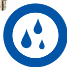
Pressure dew point