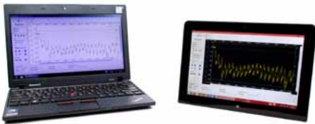
Note: Laptop and Tablet not included

The PGA-710B's unique software will instantly perform mathematical and statistical functions to assist ESD Program Managers and Plant Auditors in defining strengths and weaknesses of the ESDS device transport and handling process.